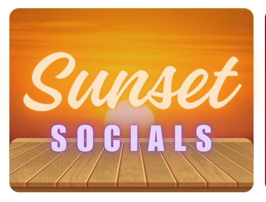
Sunset Socials April 12, 27 & May 4 | 6:00 - 8:00 pm LCR Deck

Come enjoy a relaxing evening on the LCR deck with other members and friends of LCR. You are welcome to invite friends. Please bring an appetizer and beer, wine, or another beverage of your choice.