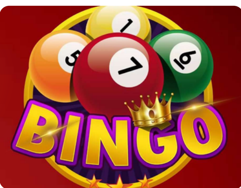
Bingo Night April 13 | 6:30 - 9:00 pm Gathering Room

Come for a night of fun, fellowship, and Bingo. Enjoy appetizers at 6:30 pm, Bingo will start at 7:00 pm. Bring an appetizer to share and your own beer, wine, or other beverage.